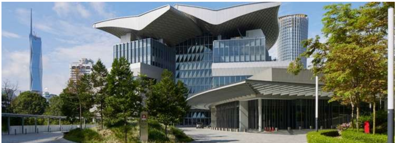
Asia School of Business Campus