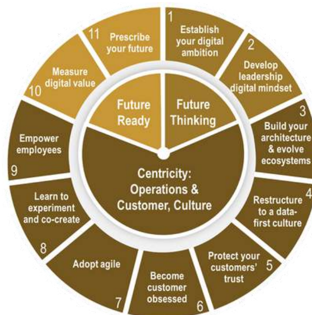
The Ticking Clock® Model

This Model is based on research involving more than 5,000 leaders across four continents and 18 countries.